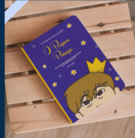
03 TCC PROJECT: ADAPTATION OF THE LITTLE PRINCE FOR CHILDREN WITH DOWN SYNDROME