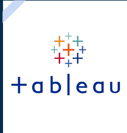
02 PROVIDERS AND BUDGET VALIDATION ON TABLEAU