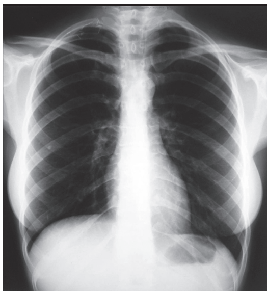
Figure 2 - X-ray on postoperative day 8, showing the metal clips, the absence of pleural effusion and the absence of the right first rib.

During the liberation of the clavicular insertion of the sternocleidomastoid muscle, extravasation of the lymphatic content was observed, and this was attributed to the rupture of a lymphatic